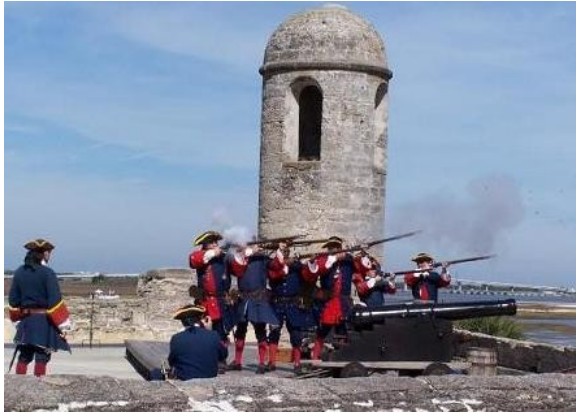
Castillo de San Marcos (fort)