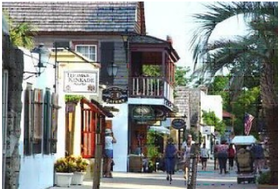
St. George Street—pedestrian mall