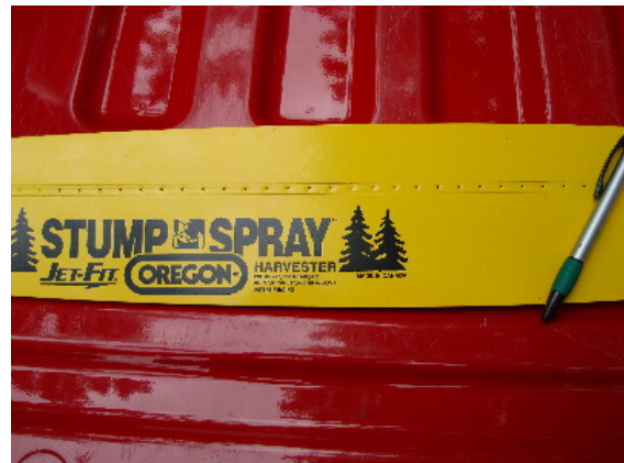
Fig. 1: Applying a liquid fungicide at the stump at the time of harvest is the most cost-effective means of inoculating a pine plantation against Annosum root rot outbreaks.

Cellu-Treat ( Disodium Octaborate Tetrahydrate ) is water-soluble. As a solution, it can be applied by a backpack/hand-held sprayer, or mechanical harvester. One advantage is that it is easy to apply, and application is especially efficient with a harvester. Studies demonstrate that the cost per acre to apply is much less than the cost of a Sporax treatment. A big disadvantage is that the solution can freeze, thereby preventing winter application. To answer this problem, European users have been using an anti-freeze additive for many years. In the US, however,