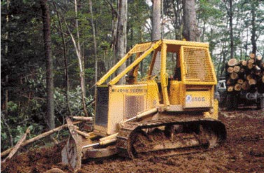
Fig. 2: Video topics apply especially to dozers used for skidding and road construction in hilly terrain.

COST: To place an order for the video, please contact the West Virginia Forestry Association at the address shown below. The current price for the video and accompanying Discussion Leader's Guide is $15 for West Virginia Forestry Association Members and for government and university personnel; the price is $25 for others. 1